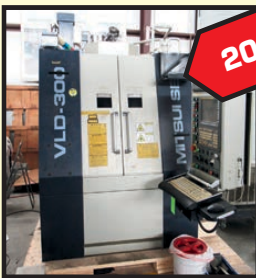
2008 MITSUI SEIKI MDL. VLD-300 5-AXIS CNC LASER DRILLING MACHINE

WEDNESDAY, APRIL 24 • 10:00 A.M. CDT LIVE ONLINE WEBCAST (NO ONSITE BIDDING)