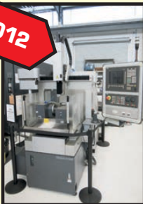
2012 ELENIX MDL. EDM DRILL CT500F EDM DRILL