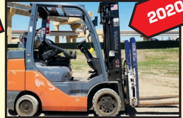
2020 TOYOTA 6,500-LB. BASE CAP. MDL. 8FGCU32 LPG FORKLIFT