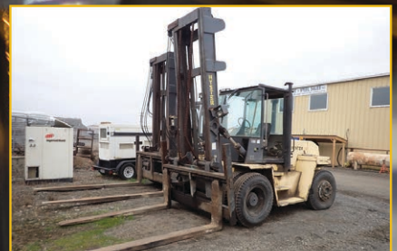
2000 HYSTER H190XL

James G. Murphy Co. - Murphyauction.com - 425.486.1246