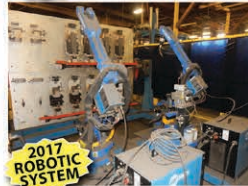
2017 ROBOTIC SYSTEM