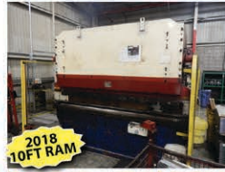
2018 10FT RAM