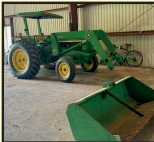
JOHN DEERE MDL. 1520 UTILITY TRACTOR