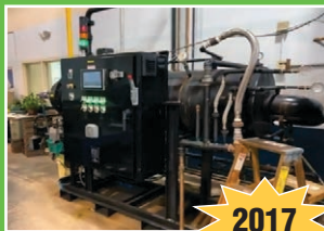
Atmosphere Engineering A11636 Exothermic Generator