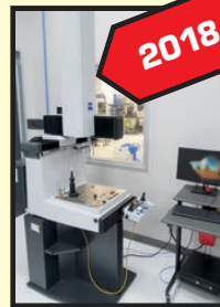
2018 ZEISS DURAMAX LTE CMM