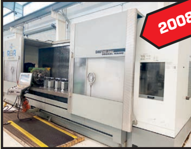
2008 DECKEL MAHO MDL. DMF360 LINEAR CNC VERTICAL MACHINING CENTER

EARTH MOVING MACHINERY • CNC & MANUAL MACHINE TOOLS & FAB Q.C. EQUIPMENT • SPRING MFG. MACHINES • (20+) FORKLIFTS • MORE!