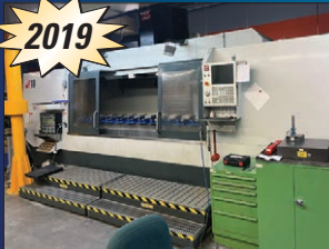
Haas VF-10/40 CNC VMC