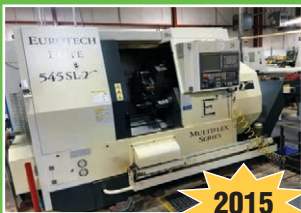
Eurotech Elite B545-YS CNC Turning Center