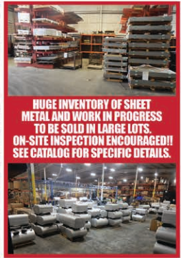
HUGE INVENTORY OF SHEET METAL AND WORK IN PROGRESS TO BE SOLD IN LARGE LOTS. ON-SITE INSPECTION ENCOURAGED!! SEE CATALOG FOR SPECIFIC DETAILS.