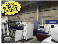
2022 W/AUTO LOADER