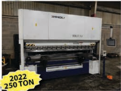
2022 250 TON