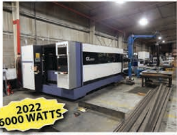
2022 6000 WATTS