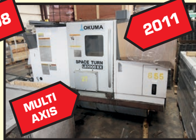
2011 OKUMA MDL. LB3000 EX MULTI-AXIS CNC TURNING CENTER