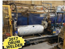
2017 DRUM WELDER

INSPECTION: MONDAY* APRIL 29 TH * 9AM-4PM