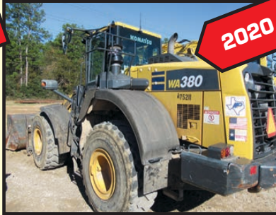
2020 2020 KOMATSU MDL. WA380-8 ARTICULATED WHEEL LOADER