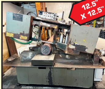
12.5' X 12.5' HEM MDL. H90A AUTO. HORIZONTAL BANDSAW