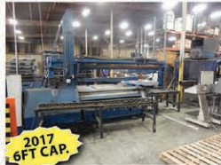
2017 6FT CAP.