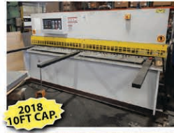
2018 10FT CAP